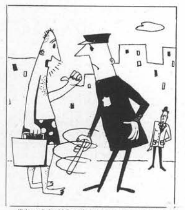
"I know I shouldn't walk around like this, but when the Red Feather Compaign man said 'give', I GAVE!"

This is your Community Chest-Red Cross United fund at work. American Red Cross goal this year: $61,960. Give!